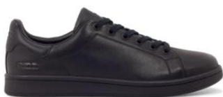
Example of “Vortex” style shoe which can be purchased via Wearitto.