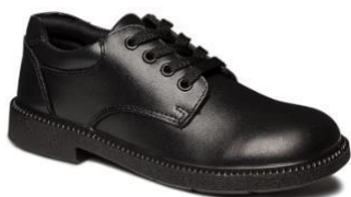
Example of black lace-up leather standard school shoe.

These are available via external providers, or the “Vortex” style shoe (picture below) can be purchased via Wearitto.