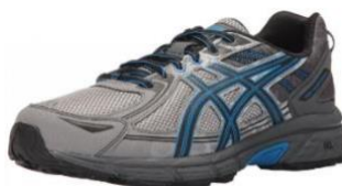
Example of sports uniform joggers with laces and non-marking sole.

Joggers with laces and non-marking sole.