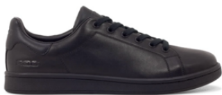
Example of “Vortex” style shoe which can be purchased via Wearitto.